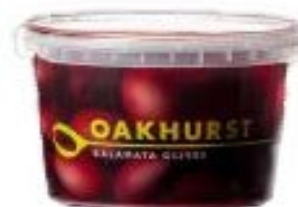
Kalamata Olives 200g tub