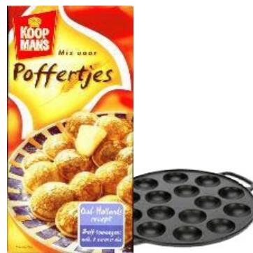
Koopmans Poffertjes and Poffertjespan 400g