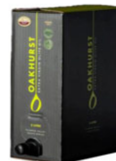
Virgin Olive Oil 1 and 5 lt box delicate, intense, premium