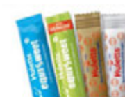
Hullets Sugar Equisweet/ brown/white