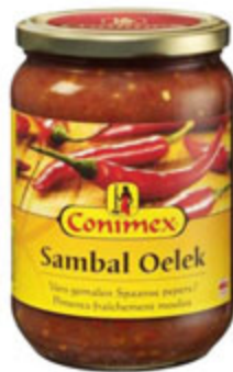
Conimex Sambal Oelek 200g