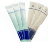
Lavazza Sugar brown/white