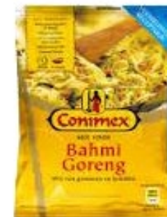
Conimex Mix V. Bami Goreng 36x48g