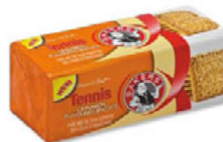
Bakers Tennis 12x200g