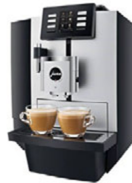
Jura Impressa X8 Platinum