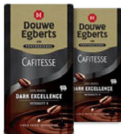
Dark Excellence Intensity 8 2 kg/1.25kg