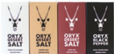
Refill packages for grinder flavours available