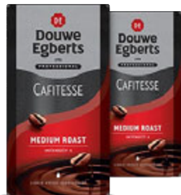
Medium Roast Intensity 4 2 kg/1.25kg