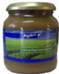
Rabarber Compote 360g