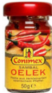
Conimex Sambal Oelek 50g