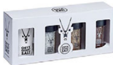
4-piece gift pack