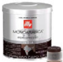
India full-bodied with notes of cacao and toast, sweet aftertaste