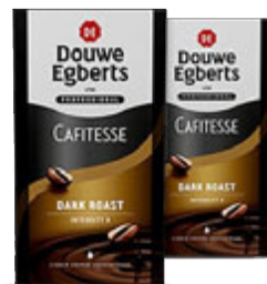
Dark Roast Intensity 8 2kg/1.25kg