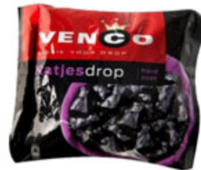
Katjes Drop Zoet 100g