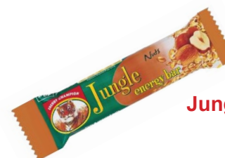
Jungle Muesli Bar 30s