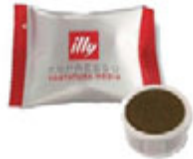
Mitaca Regular • 100s