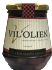
Vil'Olien Kalamata Olives In Brine 380g/3kg