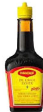
Maggi Aroma 200ml