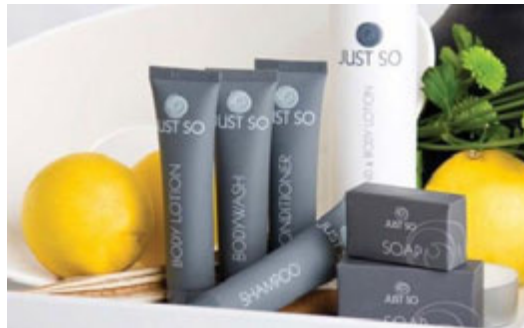
Just So range