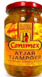
Conimex Atjar Tjampoer 350g