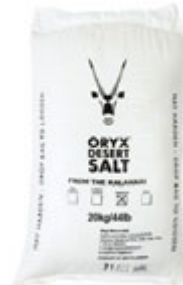
Fine/Medium/Course Salt cotton bag 10kg/20kg