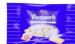
Pyotts Wheatsworth 340x15g