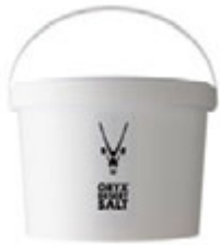
Fine/Medium/Course Salt bucket 1kg/3kg/6kg