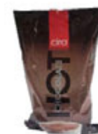
Ciro Hot Chocolate