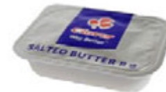
Salted Clover butter (200x15g)