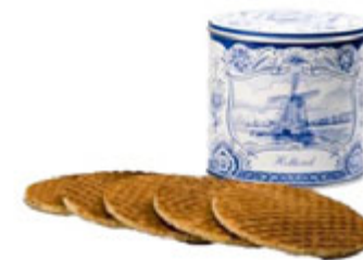
Stroopwafels + Delfts Blik 250g 300g (normal + sugar free)