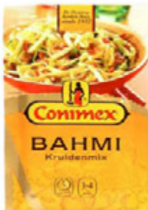
Conimex Kruidenmix V. Bami 24x23g