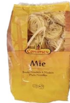
Conimex Mie Nestjes 500g