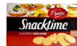
Pyotts Snacktime 12x400g