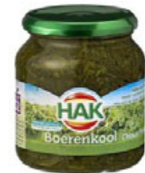
HAK Boerenkool 680g