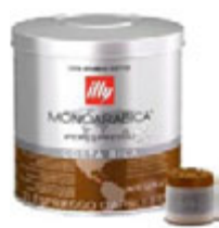
Costa Rica sweet and bold, notes of chocolate, caramel, hints of orange, honey, vanilla