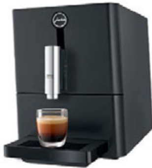
Jura Ena A1