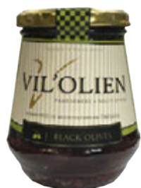
Vil'Olien Black Olives Mediterranean Dressing 380g/3kg