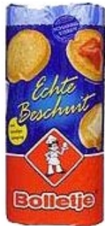
Beschuit Bolletjes 100g