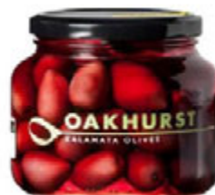
Kalamata Olives 280g jar