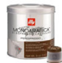
Brazil full-bodied, intense, notes of chocolate, caramel and toast