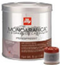
Guatemala full-bodied, sweet, notes of chocolate, caramel, citrus and honey