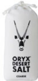
Fine/Course Salt cotton bag 1kg/3kg/6kg