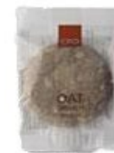
Ciro Ind Wrapped Mix 2x100