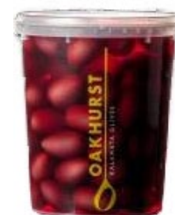
Kalamata Olives 400g tub