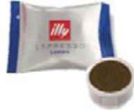
Mitaca Lungo • 100s