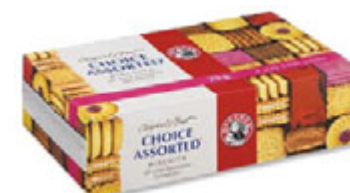
Bakers Choice Assorted 2x2kg