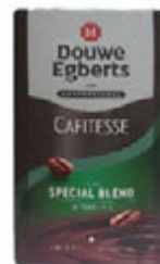
Special Blend Intensity 5 2 kg