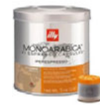
Ethiopia medium-bodied with notes of jasmine and citrus fruit