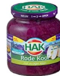
HAK Rodekool 720g