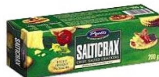
Pyotts Salticrax 12x200g