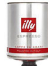
Espresso Beans 1.5kg/3kg