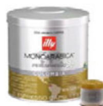
Colombia medium-bodied with rich flavours of caramel, dried fruits and cocolates