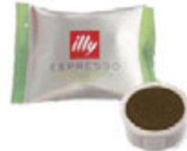
Mitaca Decaff • 100s