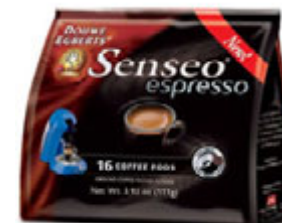
Senseo Espresso Pods