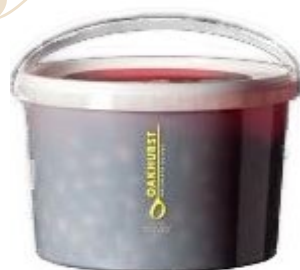
Kalamata Olives 3kg bucket