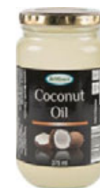
Coconut Oil 375/500ml, 1/5lt