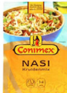
Conimex Kruidenmix V. Nasi 26x19g