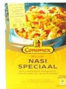
Conimex Mix V. Nasi Speciaal 12x18g