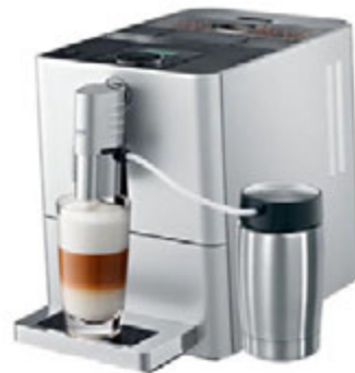
Jura Ena Micro 9 One Touch