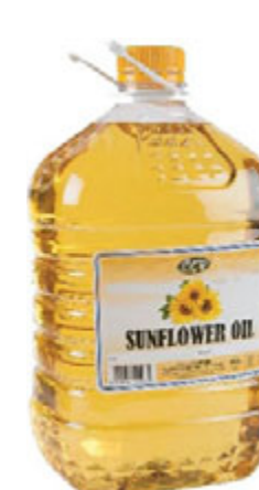
Sky Sunflower Oil 500ml, 1lt