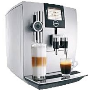
Jura Impressa XJ9 TFT