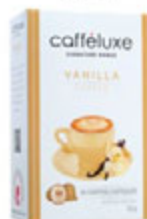
Flavoured coffees: Vanilla, Caramel, Choc-Hazelnut