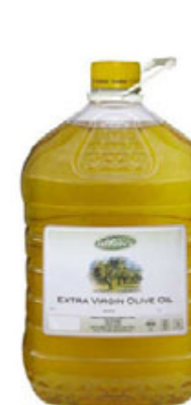
Sunflower Oil 1lt, 5lt