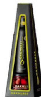
Gift Package Virgin Olive Oil 250ml, Kalamata Olives 280g jar