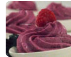
WILD BERRY MOUSE